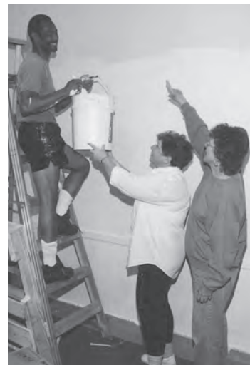
1998 Kitchen renovation