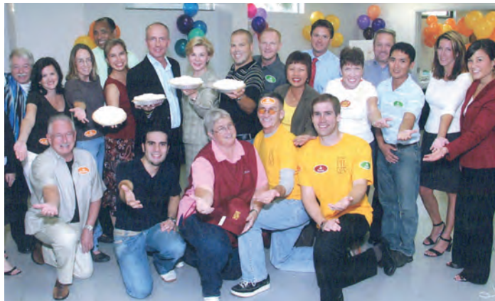
First annual Pie in the Sky, 2005