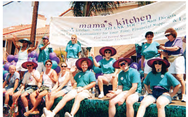
Pride Float 1996